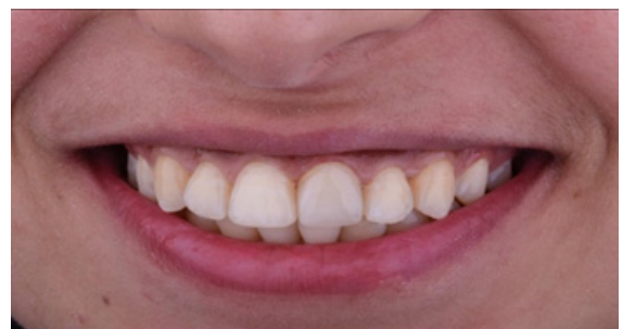
Figure 8: Finishing and polishing of the restoration with abrasive disks, fine diamond rotary instruments, rubberpoints, and a felt disk with polishing paste.

Composite restorations offer a cost effective treatment alternative where esthetics is a major concern [2,3,12]. The survival rates of these anterior composites were reported to be extremely satisfactory even in patients with worn dentition. With improvements in the bonding chemistry and introduction of nano-composites, it is speculated that the success rate of composites will improve even further [3,13,14].