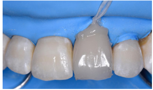
Figure 7: Insertion of translucent incisal resin (OM) between dentin mamelons. Then, the resin was applied in the LE color over the entire facial surface of the restoration to simulate the enamel.