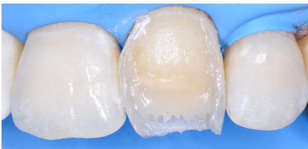
Figure 6: Application of LD dentin resin up to approximately half the width of the bevel. Observe the spaces between the developmental lobes, left when applying the opaque resin, in which the translucent incisal resin (OM) will be placed.

The micro texture was obtained with the aid of an extra fine Diamond bur. The final polishing was performed with thin grit abrasive sandpapers and felt discs with diamond past. The final restoration is seen in figures 8, 9.