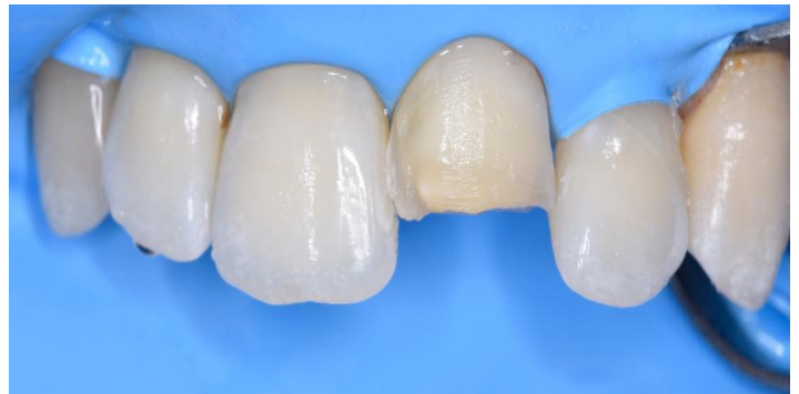
Figure 3: Rubber dam isolation of the operative field.

The operative field was isolated and the gingiva displaced with ligated rubber dam (Figure 3). The adjacent teeth were protected with polyester tape. The enamel surface was conditioned with 37% phosphoric acid, and the adhesive was then applied on the facial and lingual surfaces (Figure 4) and polymerized according to the manufacturer's instructions.