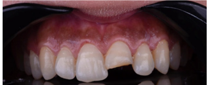
Figure 2: Intraoral photograph. Close view of the coronal fracture of tooth #21 involving enamel and dentin without pulp exposure.

The clinical and radiographic examinations showed the fracture did not involve the pulp. Because the fragment was missing, the decision was to restore the fracture immediately by direct composite resin using a freehand technique as a simple approach (Figure 2).