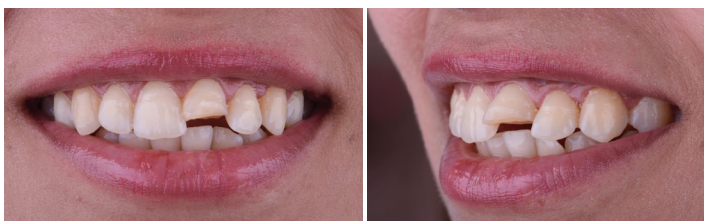
Figure 1: Pre-operative view.

A 13-year-old girl was reported to the my Paediatric Dental Clinic,Jerusalem,Palestine for the treatment of fractured upper front teeth with esthetic concern. Patient gave history of trauma 2months back due to fall from a bicycle. Clinical examination revealed Ellis class II (uncomplicated) fracture in relation to 21. (Figure 1). The tooth was asymptomatic without any associated soft or hard tissue injuries to the supporting tissues. Intraoral periapical radiograph confirms the absence of pulpal or periapical pathosis.