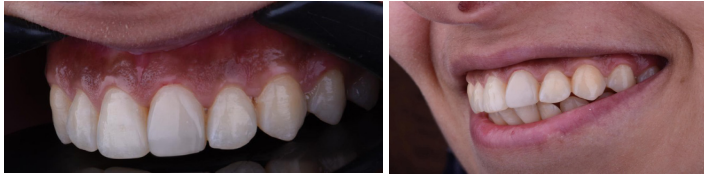
Figure 9: Smile view, harmony of shape, color, and function of the tooth have been restored.

procedures. The use of some planning strategies enables greater dental structure preservation and result predictability [11,15,16]. The choice of resin composite should be focused on aspects related to the strength and aesthetics. Within this context, the composite layering is the key to obtaining esthetically successful restorations [14,16].