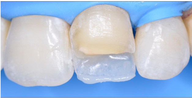
Figure 5: Facial, lateral, and incisal views immediately after application and polymerization of the resin to form the lingual “shell” with enamel resin.

Before finishing and polishing, the last layer of composite was photopolymerized for 1 additional minute under glycerine air-block; this additional step is important to increase the hardness of the superficial layer as it increases the degree of conversion of composite that prevents the deterioration of the restoration and the interface with the tooth (Figure 8).